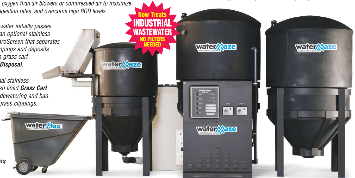
Optional cart for easy disposal of grass clippings