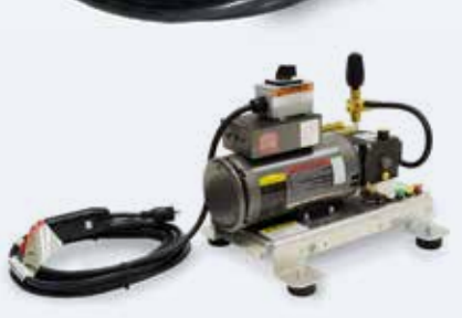
HD 3.0/10 Ea equipped shown with optional skid mount feet

50-ft of steel-wire braid highpressure hose rated for up to 3000 PSI and with 24-inch hose guard for burst protection and swivel swedge fitting for ease in handling